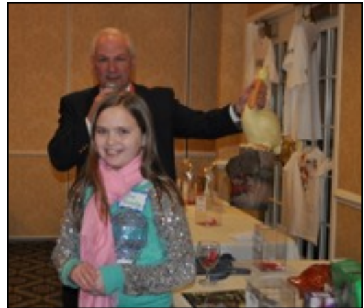
Our Raffle was a popular end to the afternoons festivities.