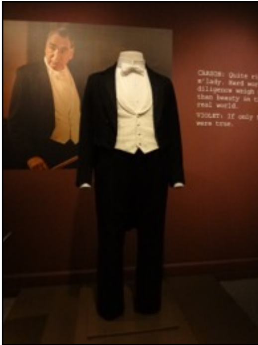
Downton Abbey Costume display at Winterthur.